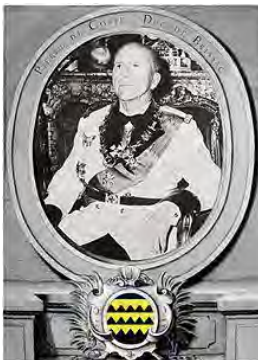
H.E. Pierre de Cossé-Brissac 12 th Duke of Brissac

H.E. Pierre de Cossé-Brissac 12 th Duke of Brissac to form a Delegation of the Order in Australia.