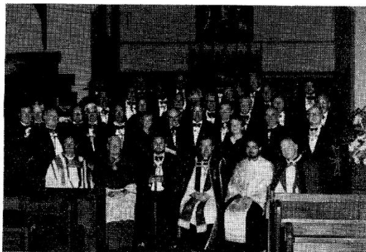
→ Investiture St. Johns Anglican Church, Gordon.

The first charitable act of the new Australian Delegation was the establishment of a new care facility – St Lazarus