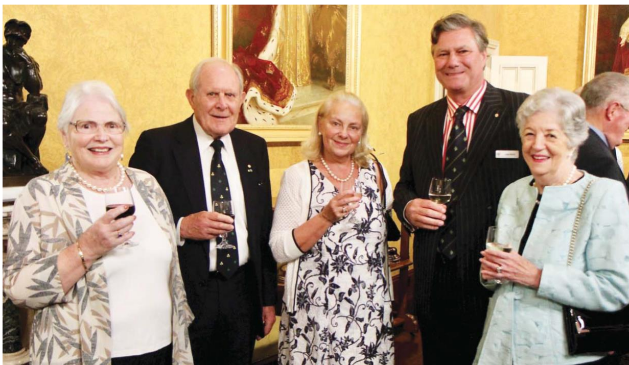
Social functions and formal dinners form a significant part of the Order's activities