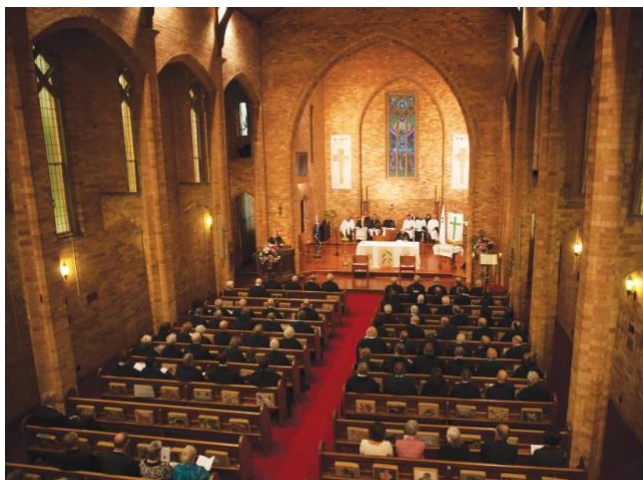
Christian worship and ceremony underpins the Order's charitable works.

In addition to promotion through the ranks of the Order, awards are made for services rendered to supported charities or to the Order itself.