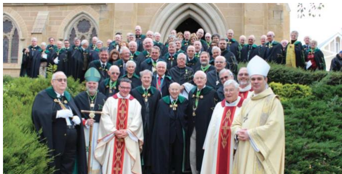
Formal attire and regalia are worn for religious services and ceremonies

Activities are chronicled in a biannual journal, the Lazarus Letter.