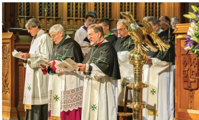
Chaplains of the Order leading a service