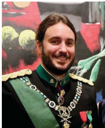
Grand Master (50 th )

While the Order's original and traditional humanitarian activities are in the field of leprosy, the Order is dedicated to guard, assist, succour and help the poor, the sick and dying, to promote and maintain the principles of Christian chivalry and to follow the teachings of Christ and His Holy Church in all its works.